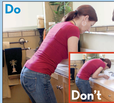
Avoid rounding your middle back to reach sink. Bend knees, keep chest and tailbone lifted.