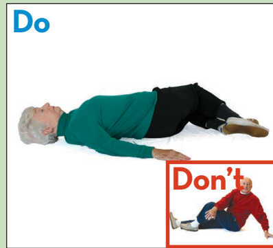
Avoid extreme seated or supine spinal twists. Gently rotation of the pelvis and legs with shoulder blades remaining on the floor.