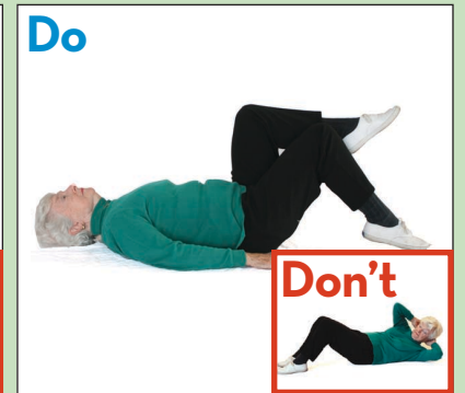
Avoid all twisting crunches. Practice lower abdominal control by dropping toes to the floor one at a time.