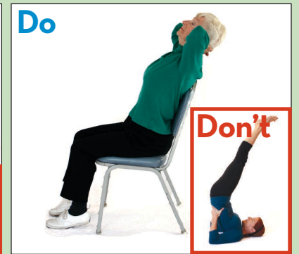
Avoid yoga shoulder stands, Pilates Bicycle and Short Spine. Instead, practice back extensions.