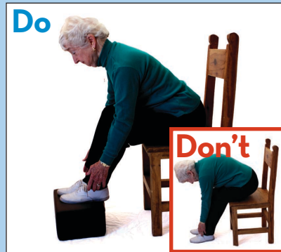
Keep chest lifted, tailbone lifted and hinge at the hip joint, not the waist.