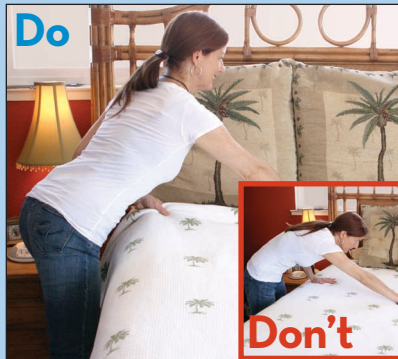
Keep chest lifted, tailbone lifted and brace knees against bed.