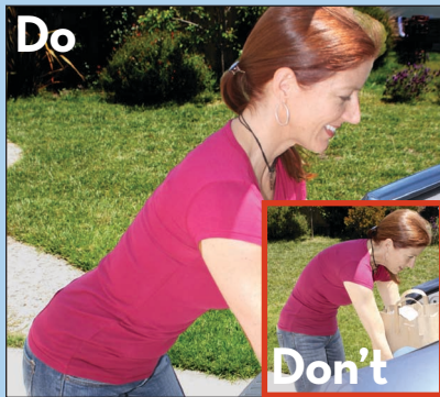
Keep spine straight, chest lifted, knees bent and pull shoulder blades back.