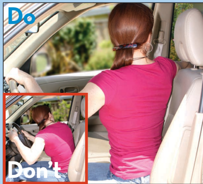
Reach right hand behind passenger headrest to brace yourself and keep chest lifted as you rotate.