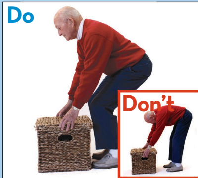
Keep spine straight, check lifted and knees bent.

AVOID ROUNDING your SPINE and SHOULDERS.