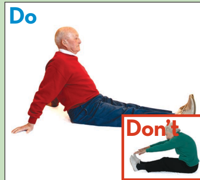
Hinge at the hips, not the waist, support spine with arms behind and lift chest.