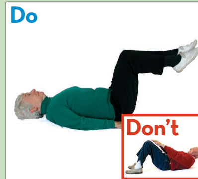
Avoid all forms of crunches. Draw in abdominals as you bring legs to 90° angle and press lower back down.